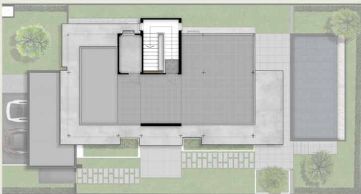
3 rd Floor Plan