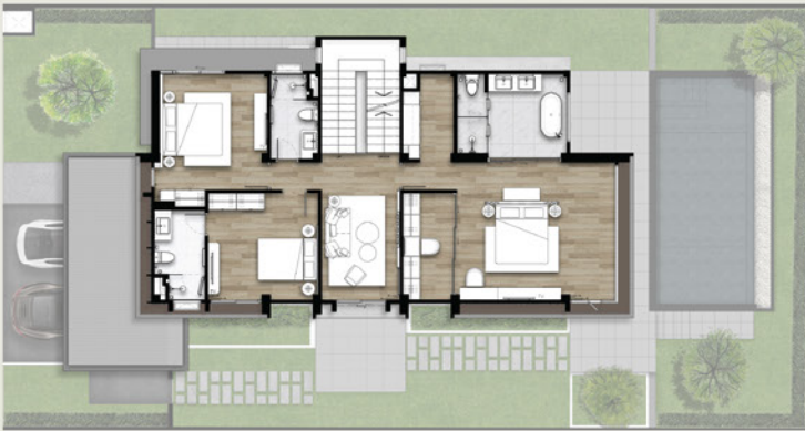
2 nd Floor Plan