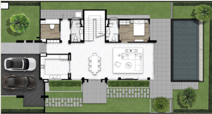
1 st Floor Plan